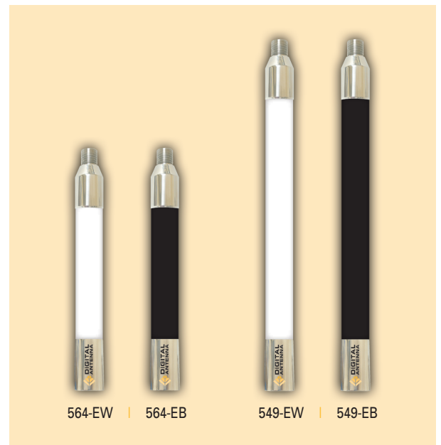
564-EW | 564-EB | 549-EW | 549-EB